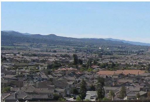
“Prevent Urban Sprawl”