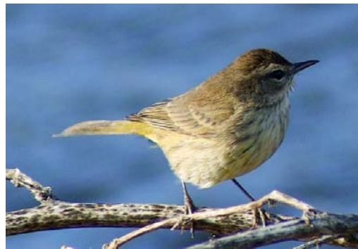
Palm Warbler, Nov 30, 2010

name deleted. Our current newsletter is posted on the Friends' web page at: www.northfriends.org