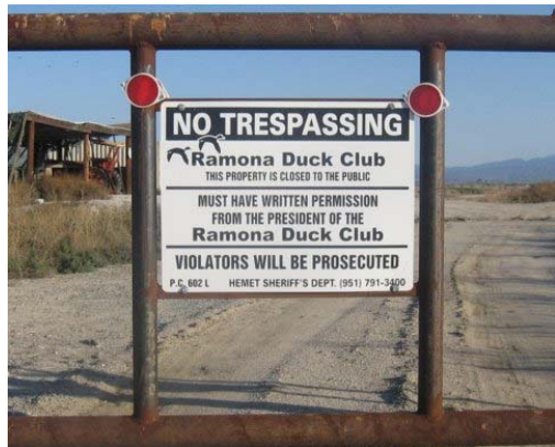
Ramona Duck Club, No Trespassing Sign, April 30, 2010