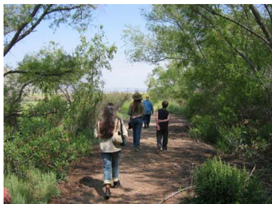
SJWA/Walking to the Reclaimed Water Ponds

Following that GPAC meetings, the County plans to release the Draft Environmental Impact Report (DEIR).