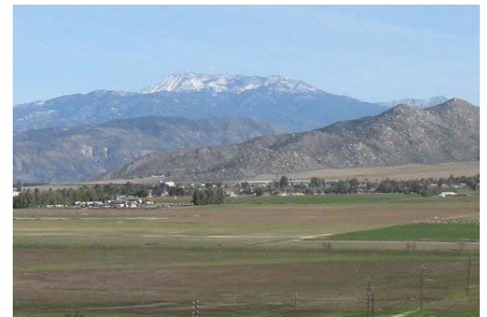
“Preserve the San Jacinto Wildlife Area”

The Friends of the Northern San Jacinto Valley is a volunteer organization. We have spent many years taking part in the approval process for the VOL project. Our members attended public meetings on the project; we submitted lengthy comments; we met with four County Supervisors to express our concerns.