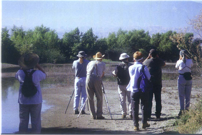
Bird watchers enjoying newly restored riparian habitat.